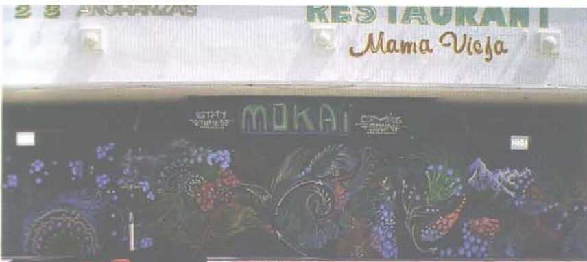
The soon-to-open Mokai in Miami Beach.